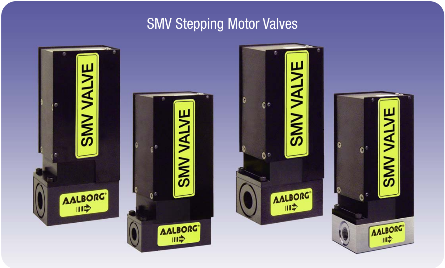
SMV Stepping Motor Valves